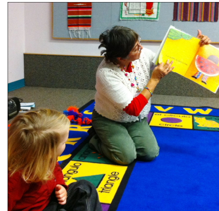
Listen to a story