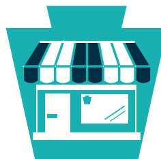
Existing Business Owner

These symbols are used to denote which sections are more useful for new entrepreneurs and which ones contain information geared toward existing business owners. Sections not designated by either icon contain information that is relevant for both types of entrepreneurs.